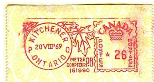
Kitchener Postage Meter

KITCHENER post office front desk postage meter with "P" and "O" in the townmark.