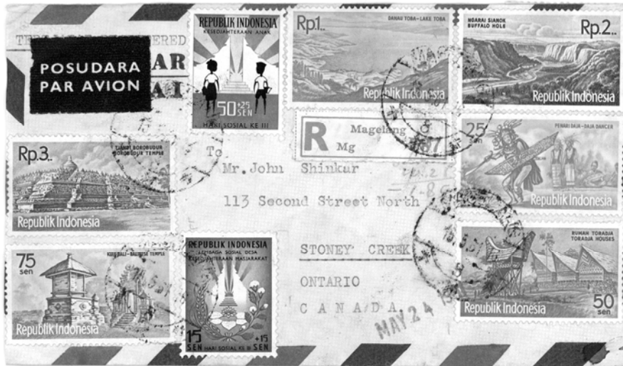
Front of registered airmail cover from Magelang, Indonesia to Stoney Creek, Ontario, Canada.

Recently discovered in an estate lot that was being promoted by one of our club's esteemed members, we found this very interesting piece franked with no less than 18 stamps. At hand we have a registered airmail cover from the Indonesian city of Magelang.