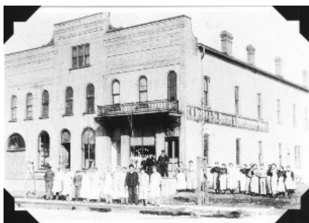
Berlin, Ontario at the turn of the century

This is our mystery picture of the month! If you have any information to share about this picture, get in touch with one of our board members!