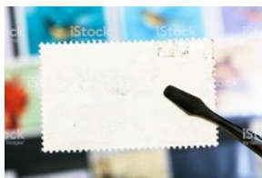
Use tongs to move stamps

Another question: why use tongs at all? They keep dirt and skin oil off the philatelic paper. For a child to learn the use of tongs, we suggest using some non-valuable stamps, or cut some stamp size paper pieces for practice.