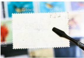
Use tongs to move stamps

Another question: why use tongs at all? They keep dirt and skin oil off the philatelic paper. For a child to learn the use of tongs, we suggest using some non-valuable stamps, or cut some stamp size paper pieces for practice.