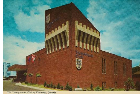
Transylvania Club at the old Andrew Street location - Kitchener