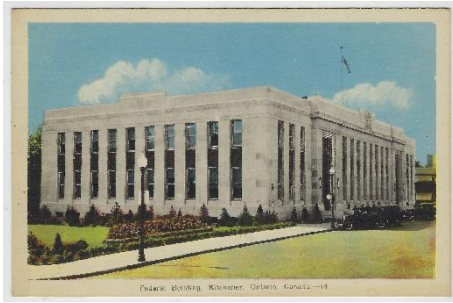
Federal Building with period automobiles parked in front - Kitchener

Additional Postcards from Kitchener Waterloo courtesy of members of the KW Philatelic Society. Some areas are mostly unchanged, and others look vastly different today.