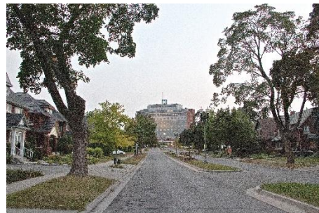
The hospital building has received a large addition and more houses have been built - 2022