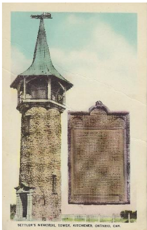
Pioneer Memorial Tower, Kitchener - 1961