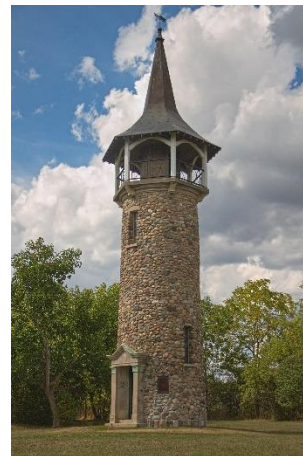
Nearby trees have grown, but the tower is unchanged - 2022