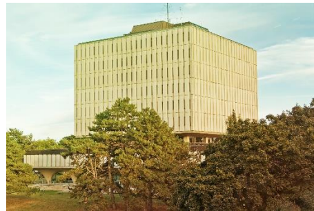
The same library has now expanded 3 storeys taller - 2022