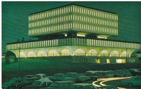
A night setting of the library building, University of Waterloo - 1969

This year, members of the KW Philatelic Society submitted a few postcards from their collections, and we headed out into town to recreate the scenes. Maybe some of the postcards you send on October 1 will be references decades from now to capture what life was like in 2022.