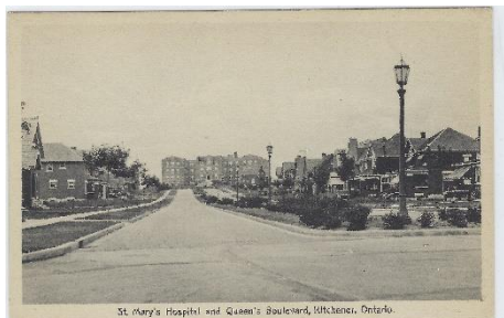
St. Mary's Hospital and Queen's Boulevard, Kitchener