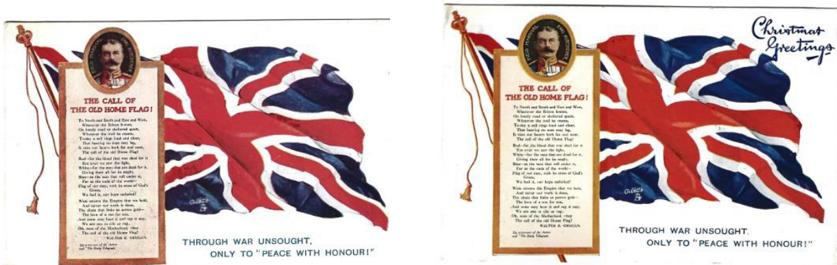
Two versions: original and re-printed for Christmas 1914

Wherever the Briton homes, On lonely road or sheltered quest, Wherever the trail he roams, Today a call rings loud and clear, That hearing no man may lag, It stirs our hearts both far and near, The call of the old Home Flag.